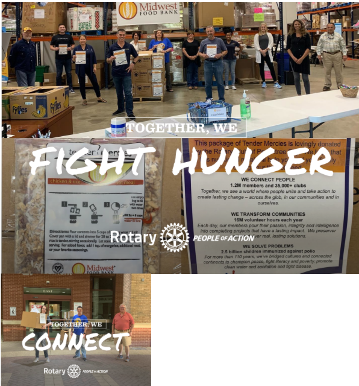
Posted by Mandy Timmons June 1, 2020