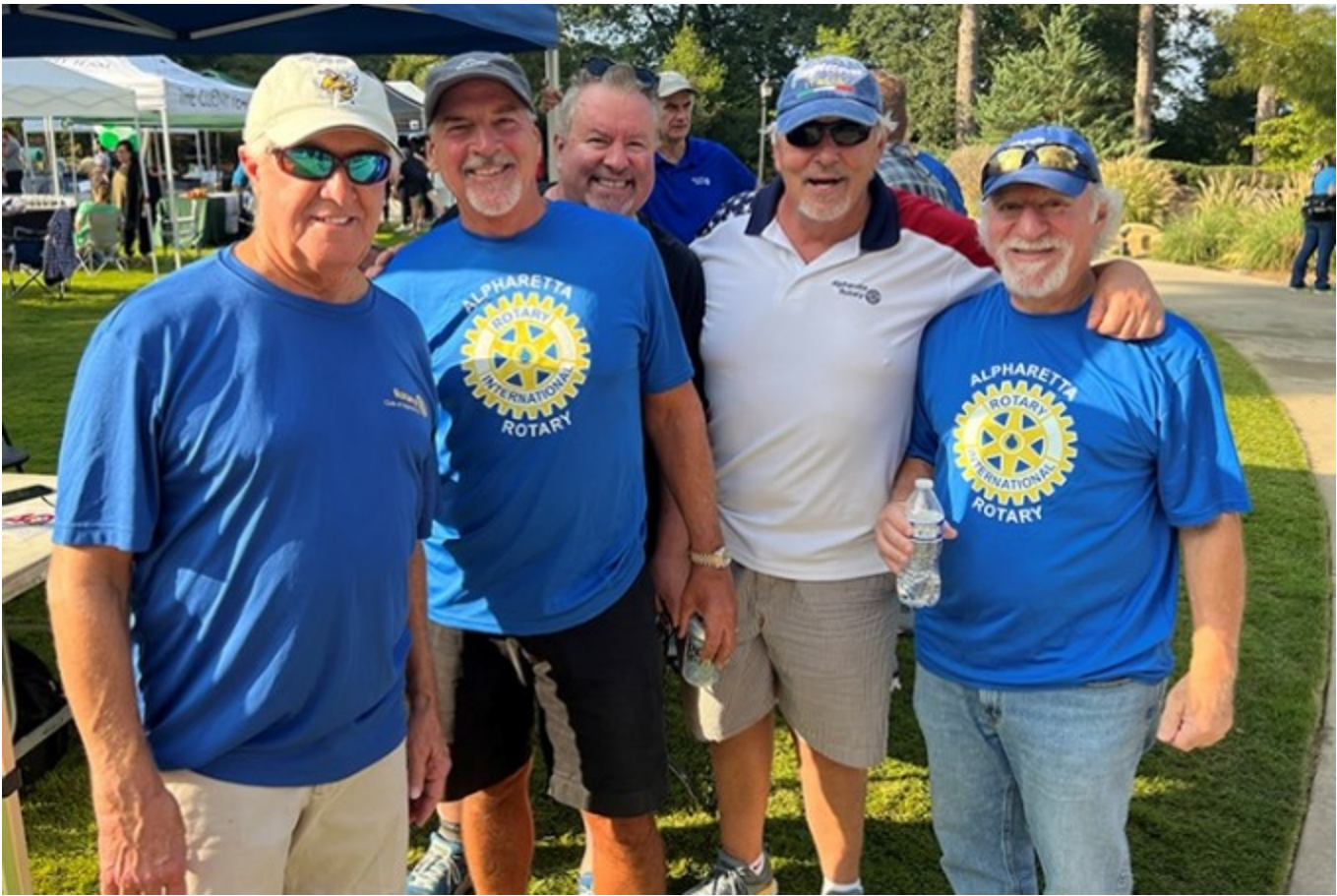
Posted by Clark Savage October 30, 2023