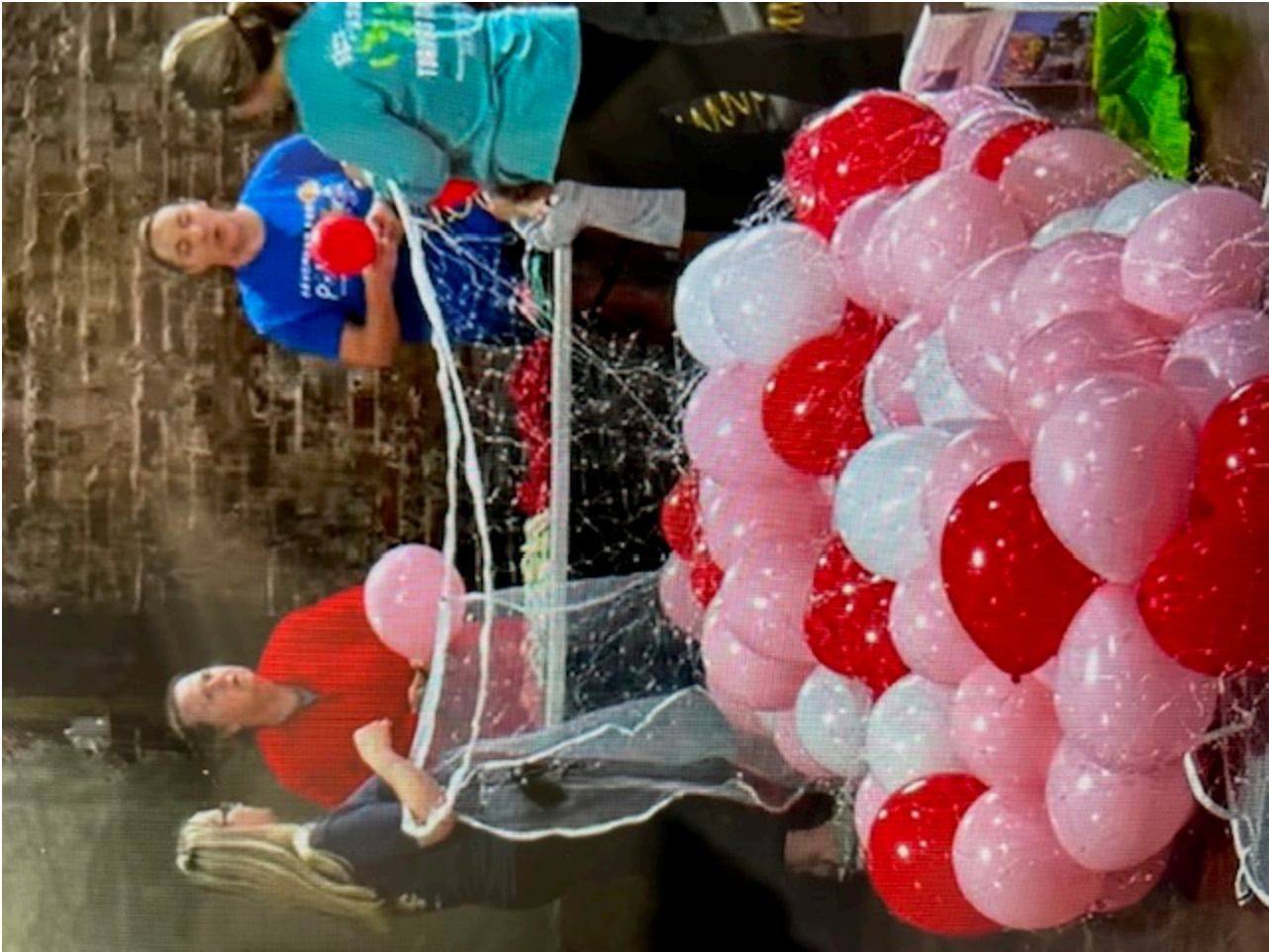
The Rotary Club of Cairo worked for months to organize and promote their Father-Daughter dance which draws a huge crowd from this Georgia town. Thanks to all their members who were there early this morning and late into the evening to make this special event happen.