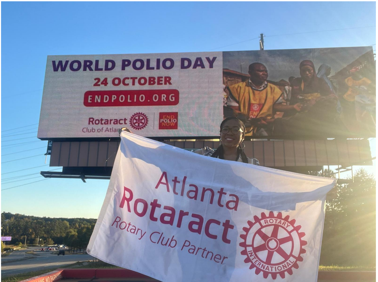
Posted by Rolanda Smalls November 5, 2005