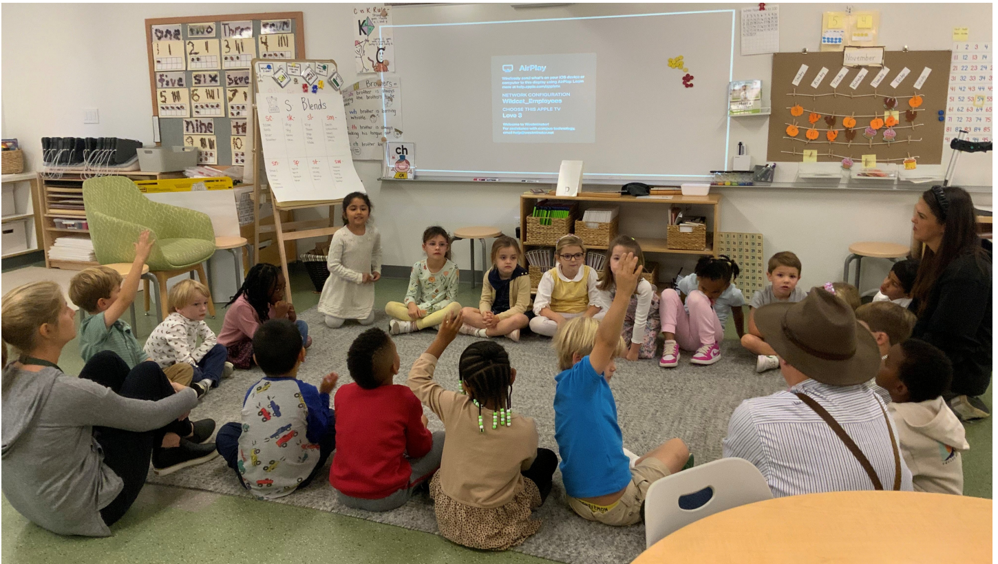
Posted by Angeli Abrol Duggal November 4, 2025