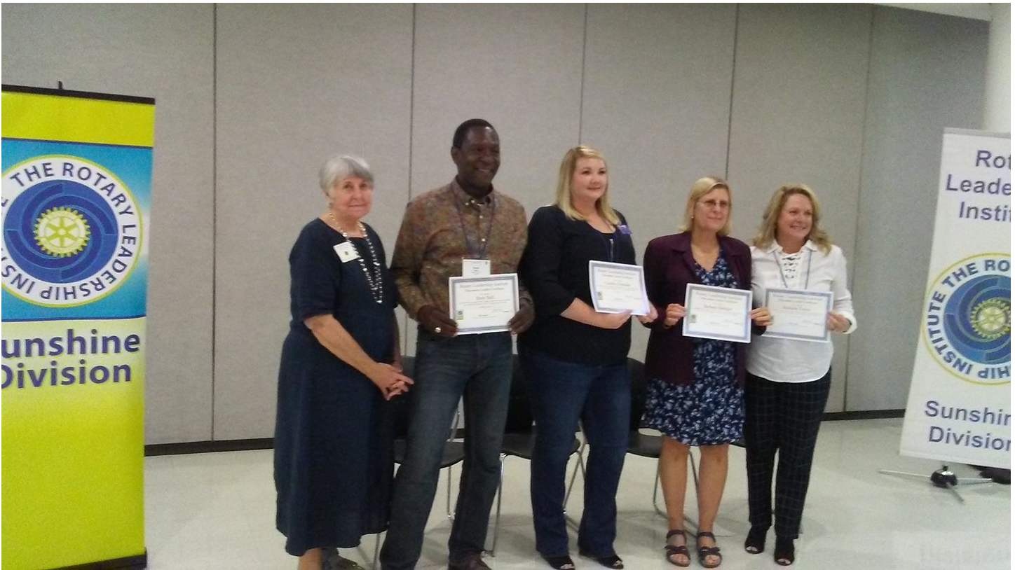
Posted by Elwyn Gaissert, II July 7, 2018