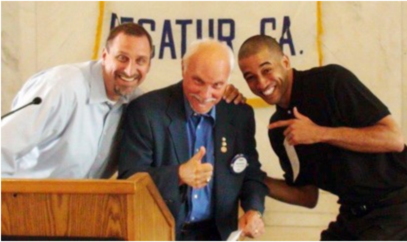
Boys and Girls Club grant recipients with Decatur Rotary's Community Grants Chair

In May, the Decatur Rotary Club presented $18,000 in grants to non-profit organizations based in DeKalb County that focus on youth literacy and at-risk youth in DeKalb County. The 2018 recipients included: