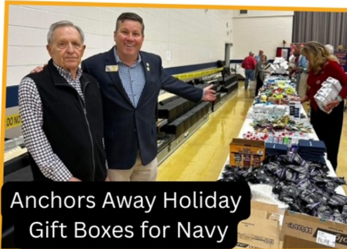
Anchors Away Holiday Gift Boxes for Navy