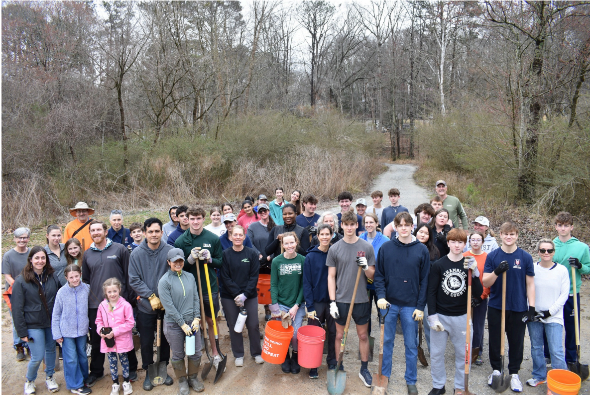
Brookhaven Rotarians joined other community groups for February's Arbor Day tree planting event cohosted by the Murphey Candler Park Conservancy and Brookhaven's Tree Canopy Preservation team