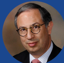
Carlos del Rio